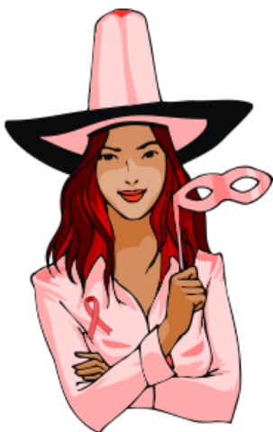
Woman in Pink