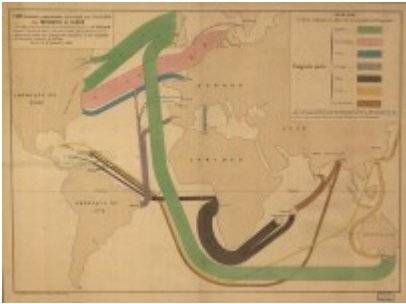
Emmigration Around The World in 1885

This past week President Obama went live on prime-time television ( with some notable exceptions ) and announced he was directing his cabinets to make some minor changes in the way people who crossed over into our part of planet earth were treated. Notable was that we, a culture that boasts about being a nation of immigrants, would no longer gratuitously tear apart families and deport parents of legal American citizens back to the countries they originated from.