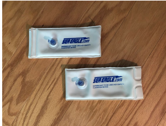
Figure 1 - Sea Eagle Skeg Protectors for 330 and 370 Kayaks

This is my design for an improved skeg protector for the Sea Eagle 330 / 370 inflatable kayaks. This is meant to be used while the boat is rolled up in storage, replacing the goofy inflatable “skeg protectors” provided by Sea Eagle.