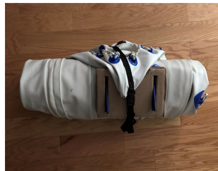
Figure 3 - Skeg Protector in Use on Sea Eagle 330

My prototype is made of scrap corrugated cardboard. Using at least seven layers of corrugated cardboard will build up enough thickness to create a solid skeg protector block. Foam board or even thin plywood could be used, although this would be more expensive. Glue the layers together using regular white glue, as this is not intended to get wet. Remove skeg protector before inflating and launching your kayak. Replace when putting the boat back into storage. Using a strap wrapped around the hull/skeg protector holds everything in place during storage.