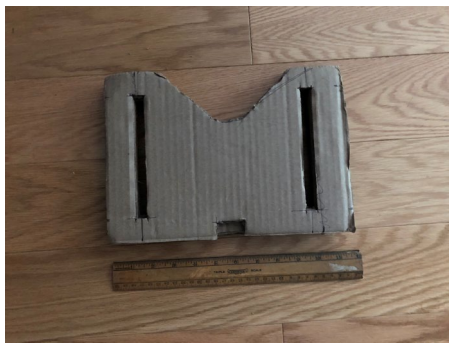
Figure 2 - Ron Charest's Prototype Skeg Protector

I consider mine a much more effective design for keeping the skegs from folding over in storage. This typically causes the skegs to be bent over while in the water, which renders them useless. Your results may vary. I am not responsible for bad stuff happening if you misuse this design.